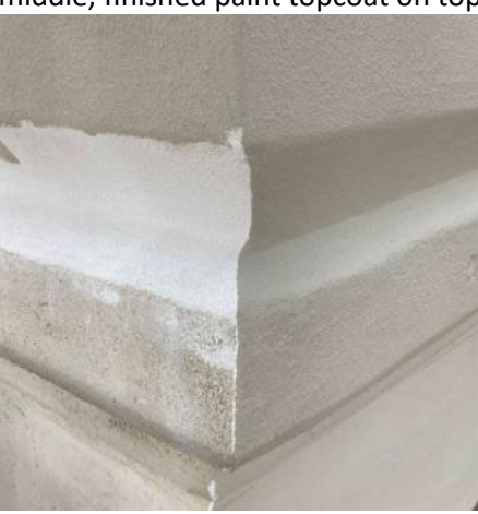
Fully painted crenellation

Three stages of paint work on the project. 30 year old paint ready to be primed on the bottom, white primer in the middle, finished paint topcoat on top, and to the right.