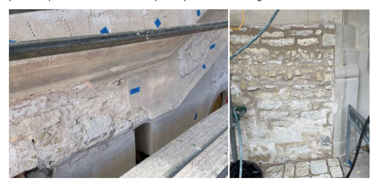
Stucco finish coats are being applied on the South façade.

The remainder of the stucco requiring repair has been removed on the East and North facades. Blue painters tape is used to number each repair for preservation tracking.